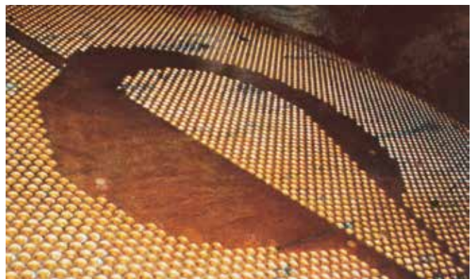
AFTER — CHLOROPAC® SYSTEM CLEAN CONDENSER TUBE PLATE